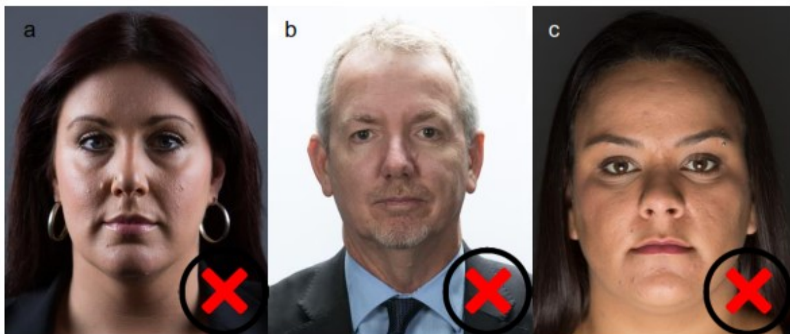
Non-compliant portraits: a) Side illumination, b) Top illumination, c) Bottom illumination.