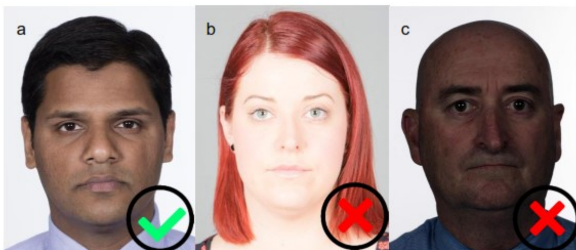
a) Compliant portrait, b) Over exposure, c) Under exposure.